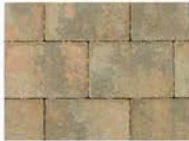
Tahoe Blend Platinum Series