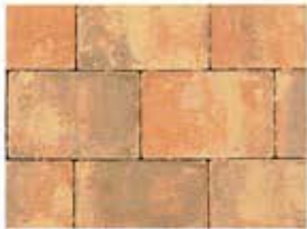
Abbronzia Blend Platinum Series