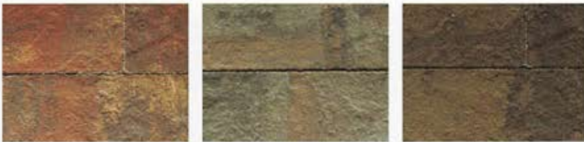
Abbronzia Blend Platinum Series